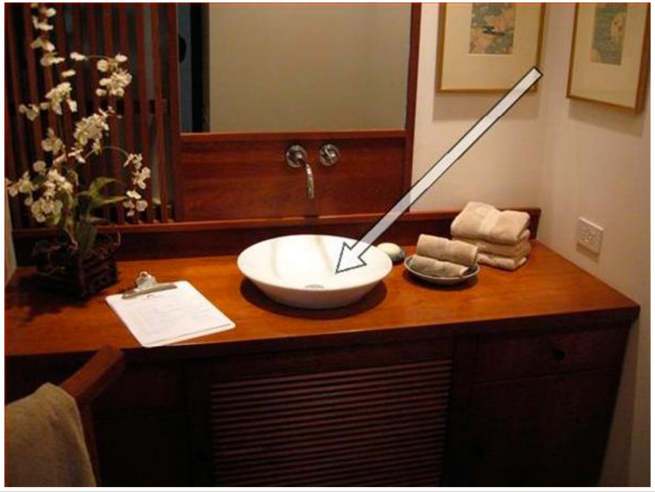
Figure Number 25

Noted sink in hall bath slow to drain. May indicate minor clog. Repair as needed.