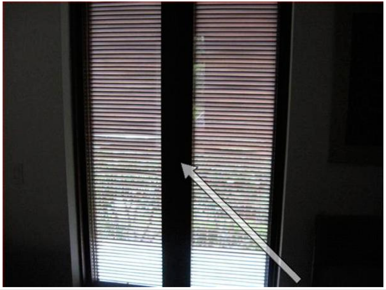
Unable to open/operate lockset of lanai doors of 2nd bedroom. Recommend minor adjustments as needed to operate.