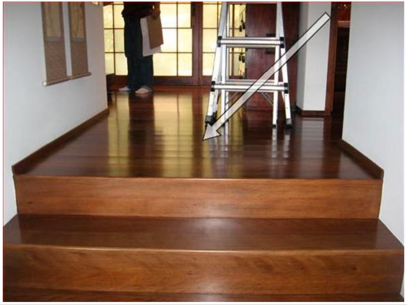
Figure Number 24

Noted minor cupping at wood floor planks at front entry. No active moisture noted. Recommend repairs as needed.