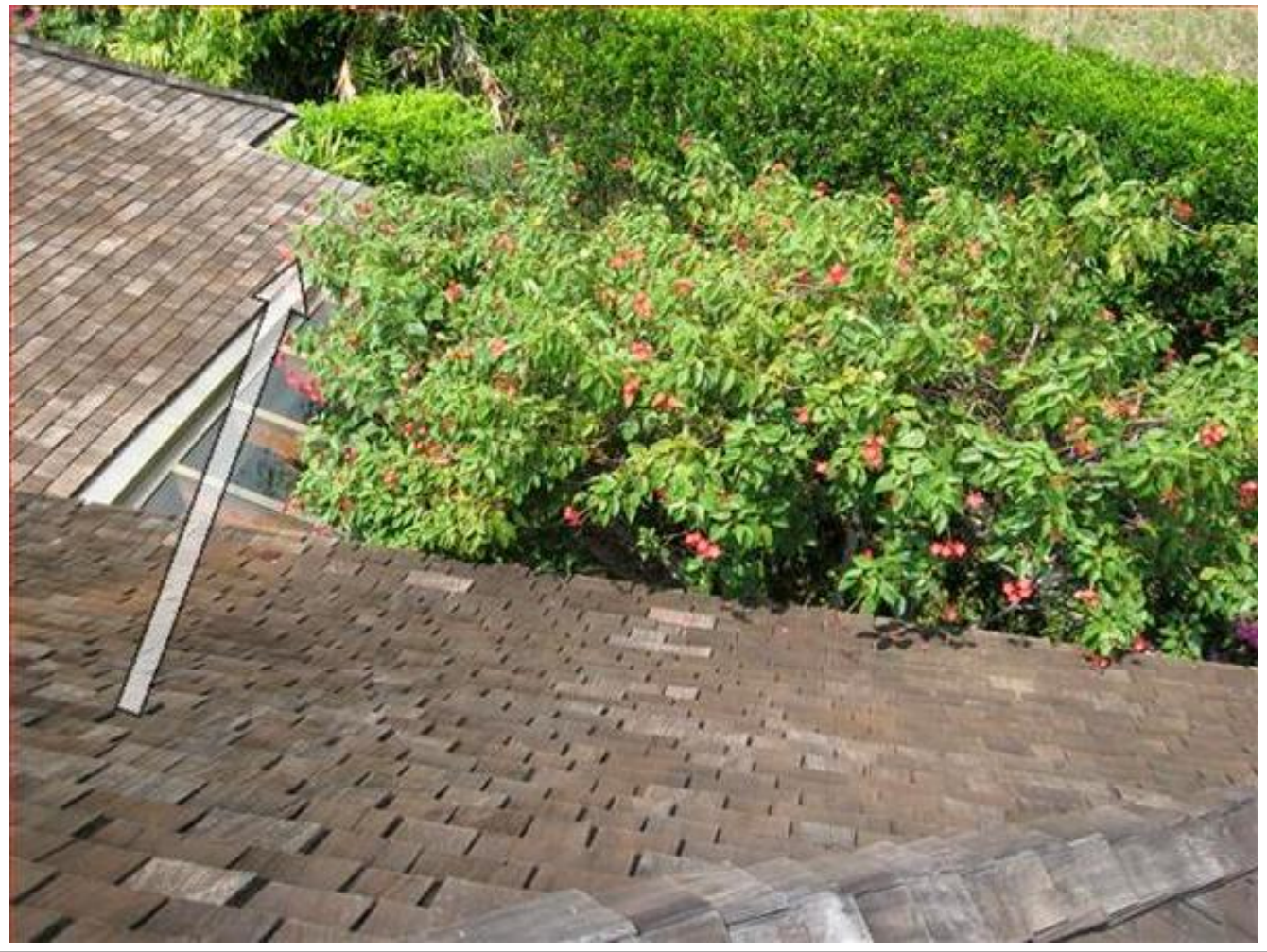
Noted tree branches in contact with roof. Recommend trimming tree from roof edge to extend roof life.