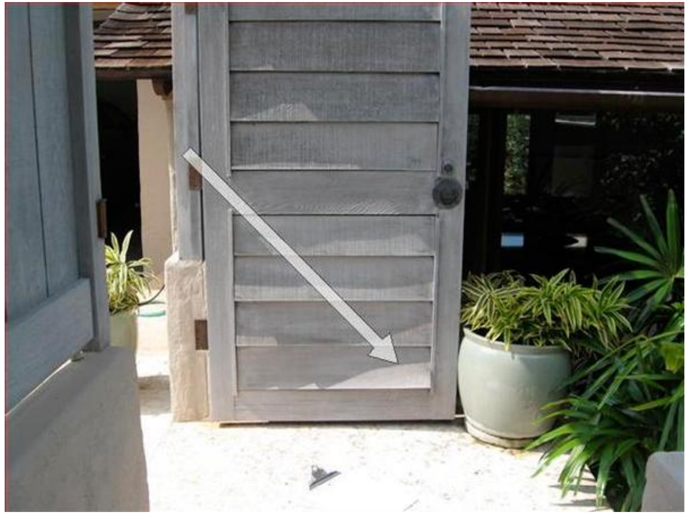
Figure Number 1

Minor repairs may be required at several gates; loose panels, binding latches, weather damage noted. Repair as needed.