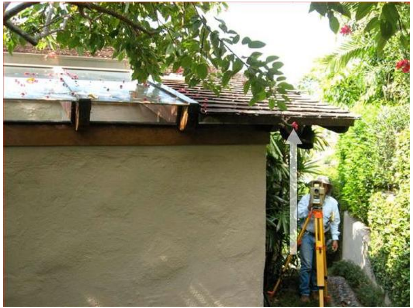
Low level moisture stains noted (21%) on wood eaves at right exterior eave. Recommend refinish to extend wood life.