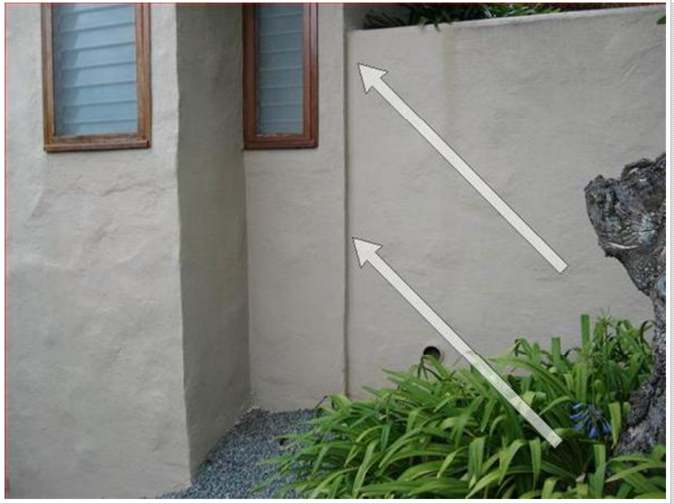
Minor separation noted at wall and structure at left middle of exterior. Recommend repairs as needed and monitor.