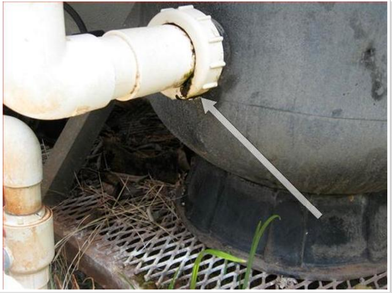
Minor water leak/drip noted on connection for pool filter. Repair as needed.