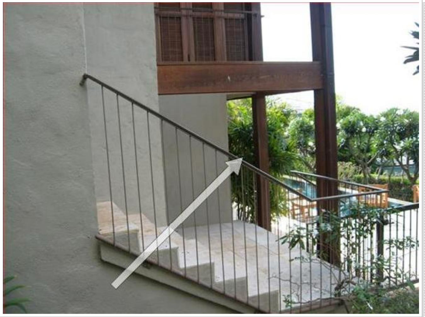
Rail caps at right side rear stair are separating from rail. Recommend repairs as needed.