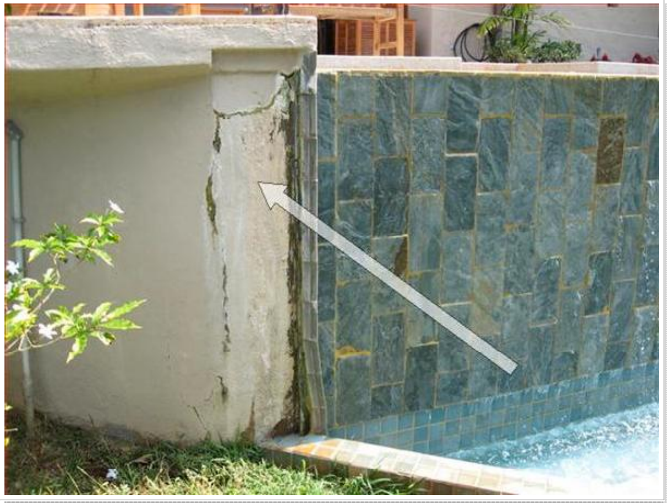
Noted minor cracking and signs of efflorescence at sides of infinity pool walls. Recommend clean and monitor for repair as needed.