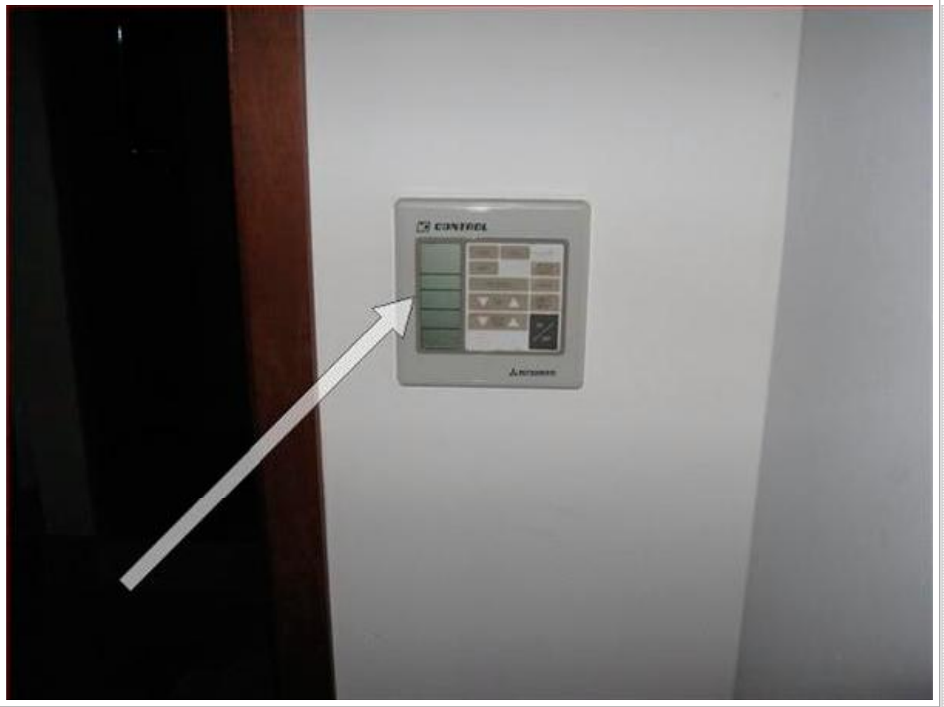
A/C control panel in rear right bedroom not operational at time of inspection. Recommend verify operation with seller.