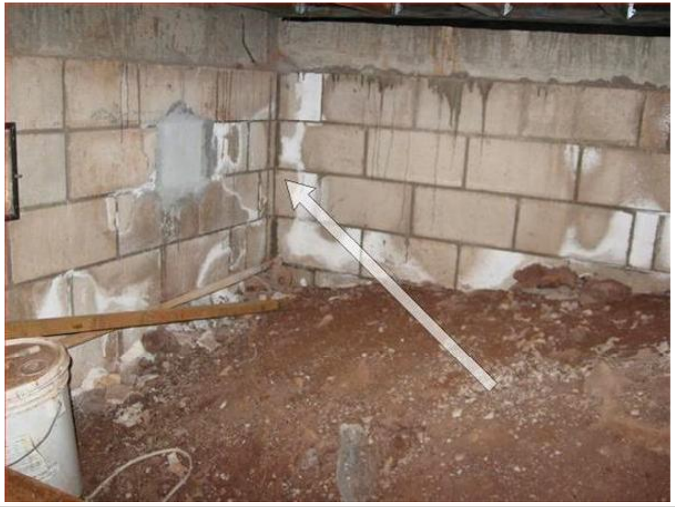
Figure Number 8

Noted efflorescence (white powdery substance) at walls in crawlspace. May indicate migration of moisture through masonry walls. Recommend clean, monitor and repairs as needed.