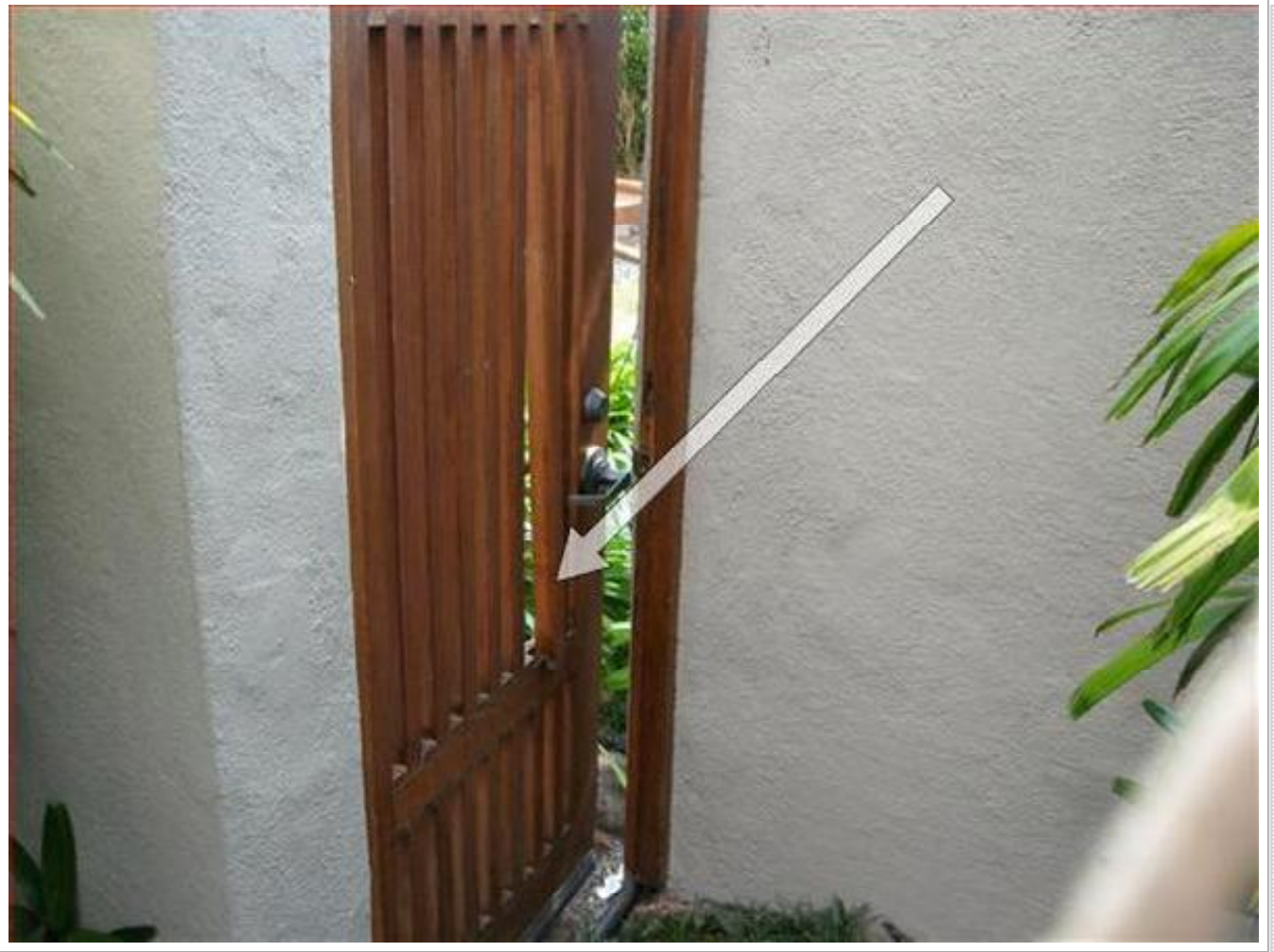
Minor repairs may be required at several gates; loose panels, binding latches, weather damage noted. Repair as needed.