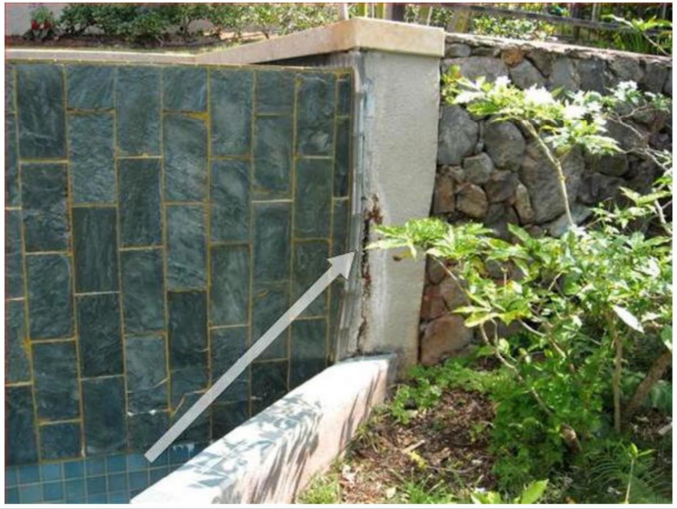
Noted minor cracking and signs of efflorescence at sides of infinity pool walls. Recommend clean and monitor for repair as needed.