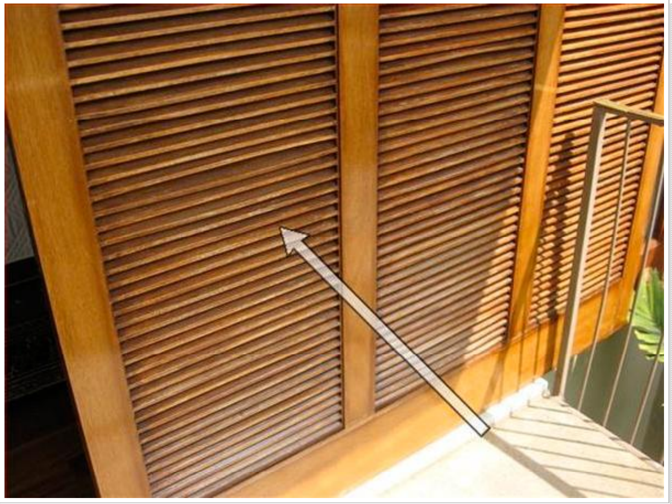
Figure Number 22

Recommend refinish exterior lanai doors of master bedroom to extend life of wood.