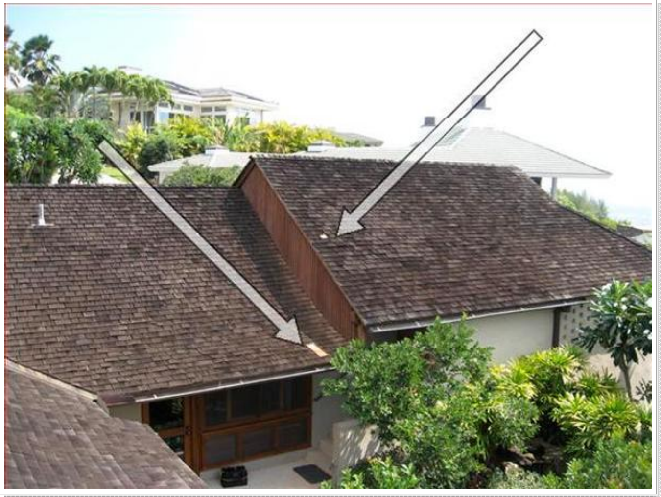
Missing shingles noted on various areas of roof. Repair/replace as needed.