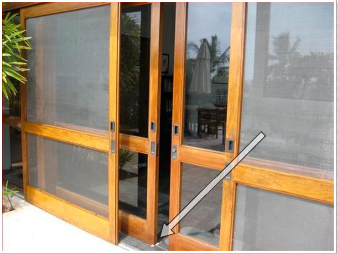
Minor adjustment/repairs may be required at sliding doors at pool.