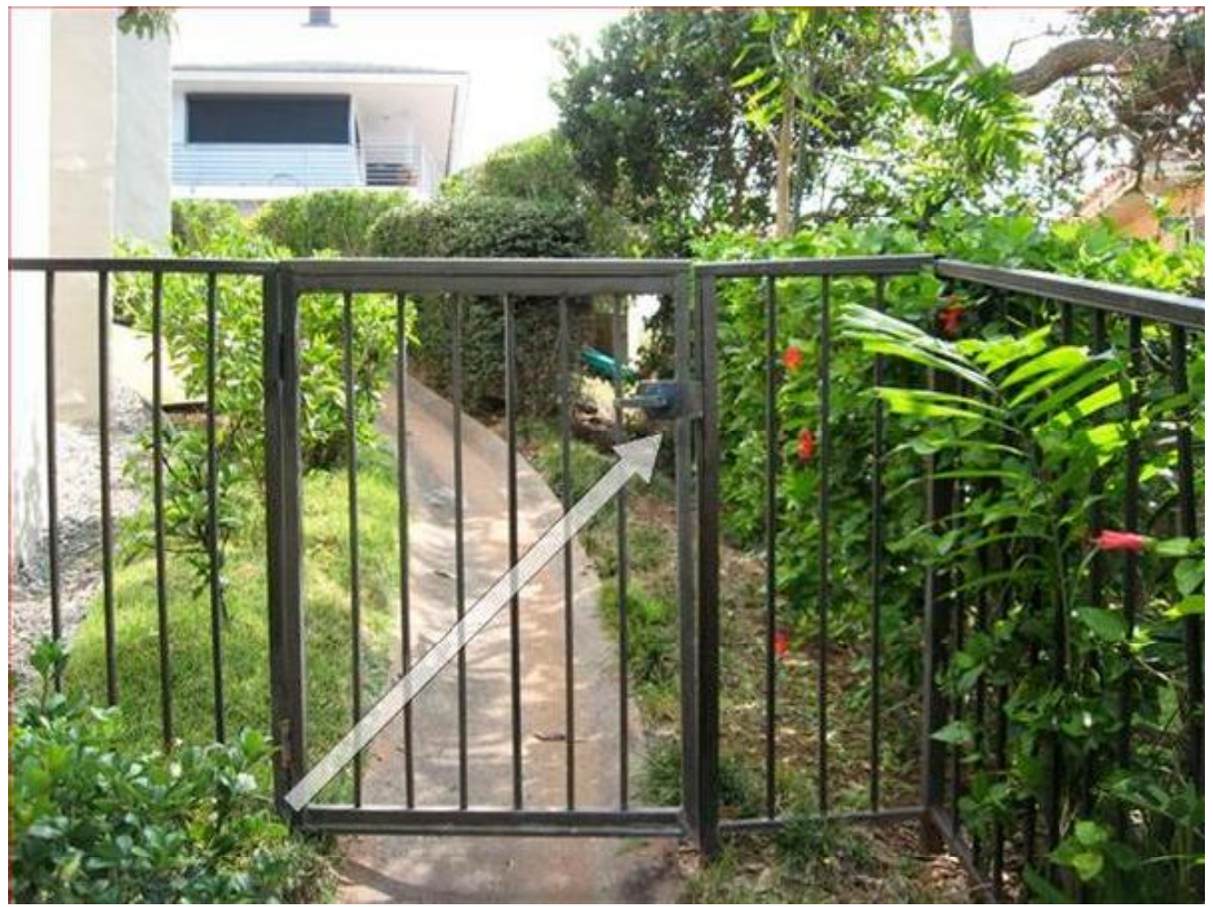
Figure Number 2

Minor repairs may be required at several gates; loose panels, binding latches, weather damage noted. Repair as needed.