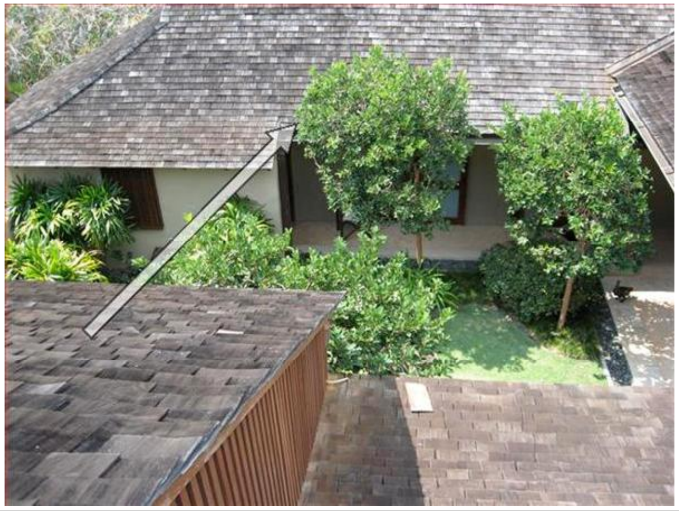
Noted tree branches in contact with roof. Recommend trimming tree from roof edge to extend roof life.