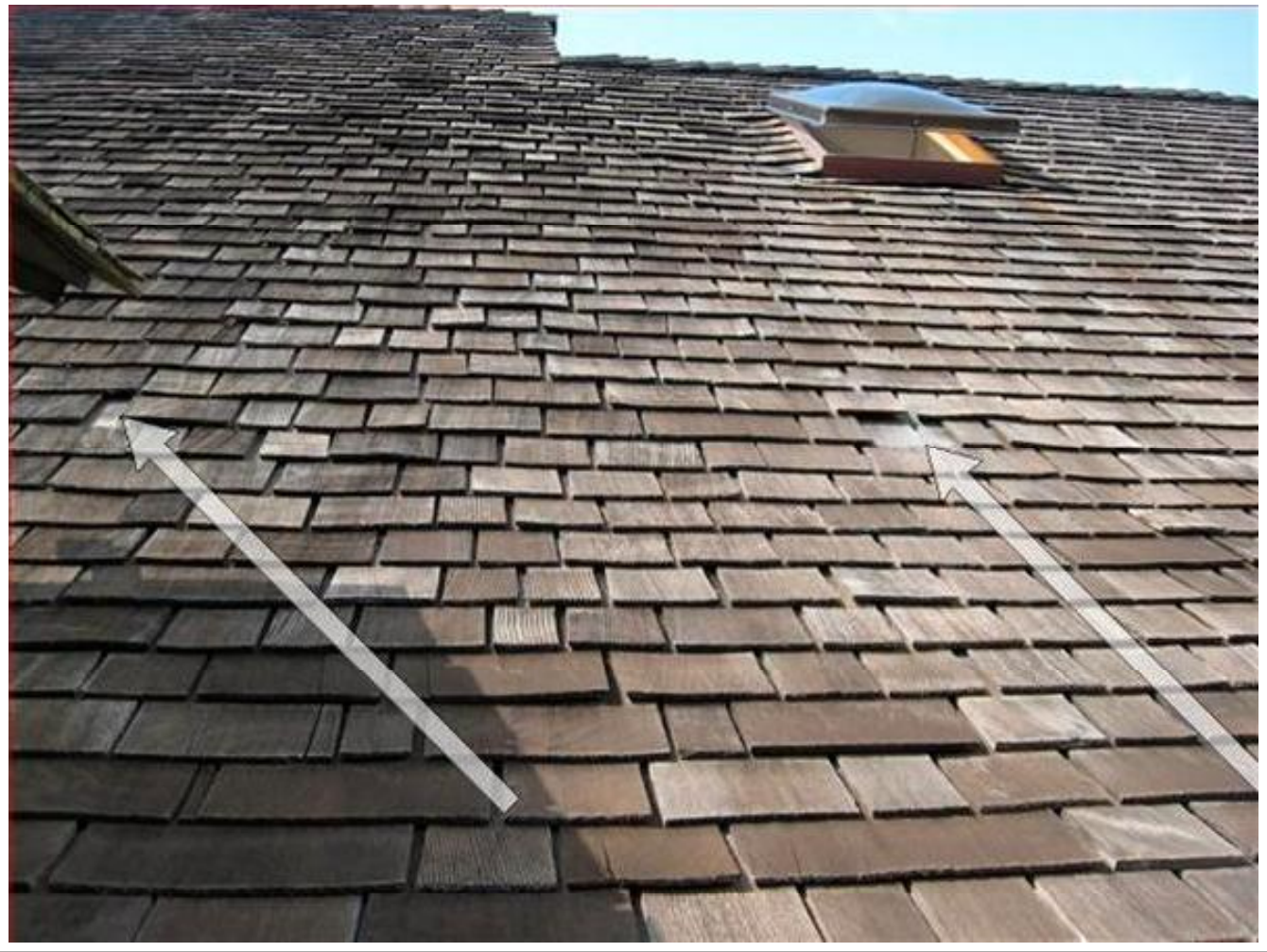
Missing shingles noted on various areas of roof. Repair/replace as needed.