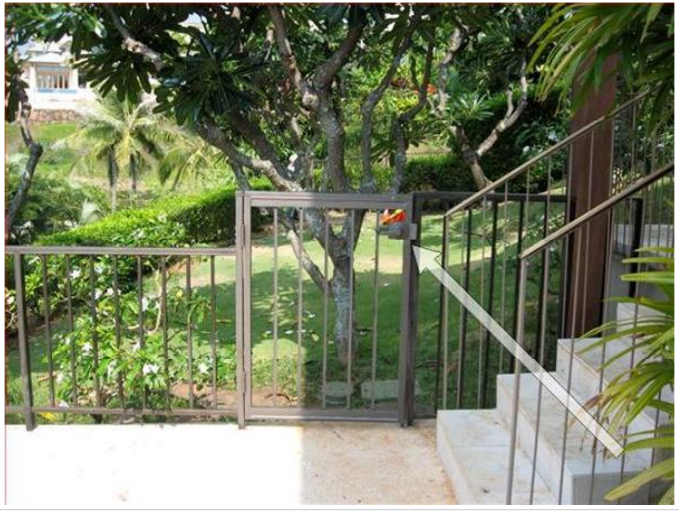
Minor repairs may be required at several gates; loose panels, binding latches, weather damage noted. Repair as needed.