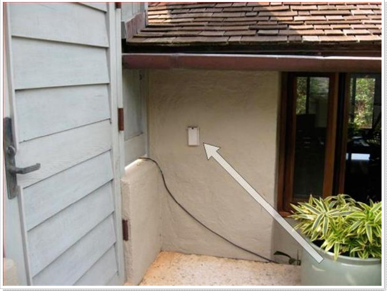
Figure Number 18

Unable to verify operation of switch at front right. Recommend verify with seller.