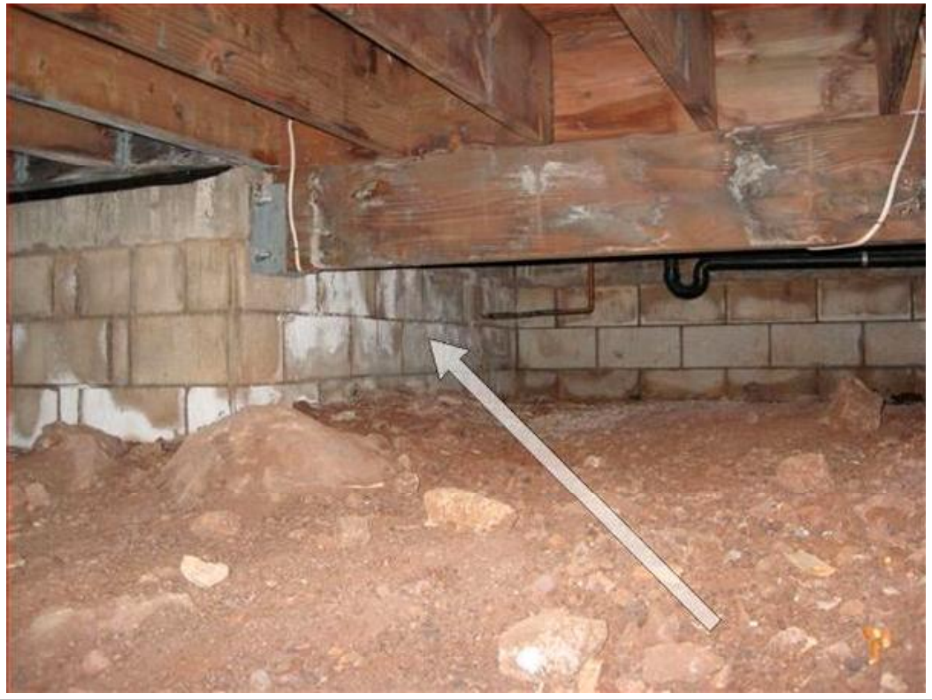
Figure Number 9

Noted efflorescence (white powdery substance) at walls in crawlspace. May indicate migration of moisture through masonry walls. Recommend clean, monitor and repairs as needed.