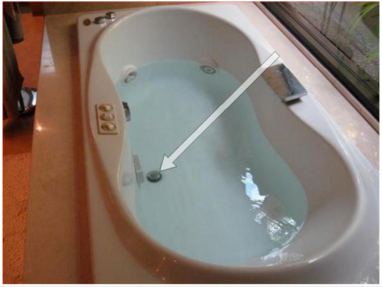
Tub in master bath was noisy when drained. Repairs recommended as needed.