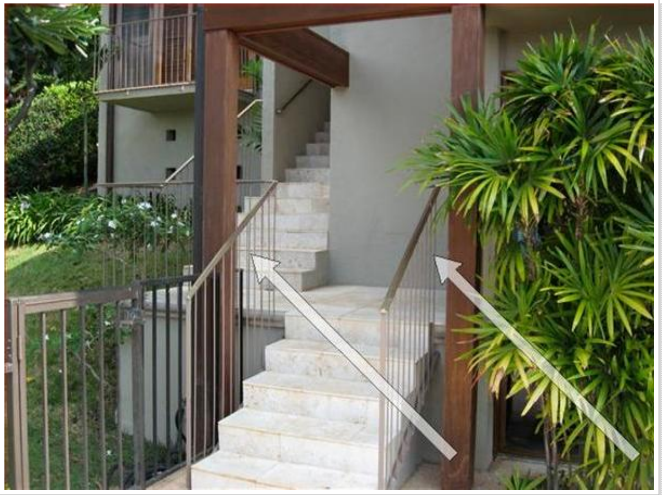
Appears the design of the balustrades at the rear right stair creates an inherent instability in the rail. Recommend stabilize as needed.