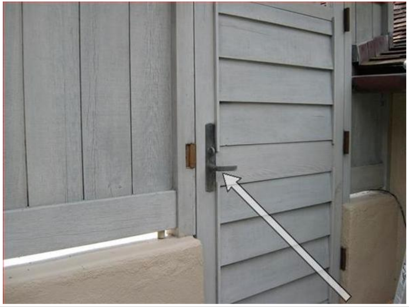
Figure Number 7

Noted lockset at front entry gate in need of minor adjustments/repairs; loose at handle.