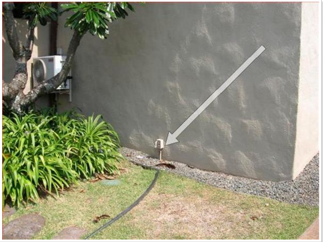
Receptacle at middle left exposed conductors and separating from wall. Recommend repairs by qualified electrician as needed.