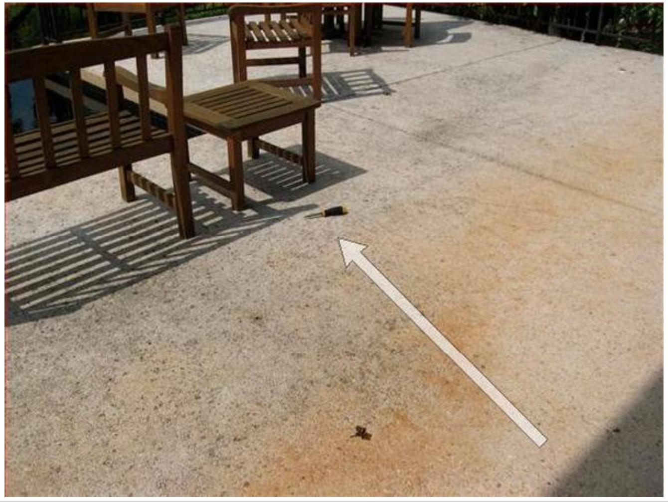
Noted hollow sounds at pool deck. Monitor and repair as needed.